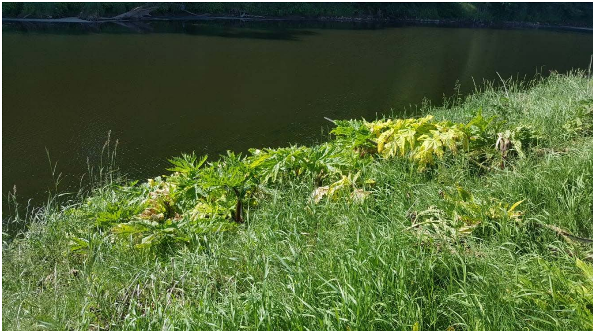
Giant Hogweed deposited by floods Any angler walking into this lot could be seriously burnt by just touching it Beware anglers who fish for seatrout at night

Further following the floods we have had farmers who have deliberately tipped rubble and hardcore into the river channel under the guise of protecting the banks. This is often an instance of good intentions becoming a nightmare as sometimes this rubble is contaminated by alien species such as Knotweed and hogweed. Due to the fact that much is soft and loose the river then transports the aliens downstream with devastating results. Indeed the big floods in recent times have washed out many alien species, which have multiplied further downstream.